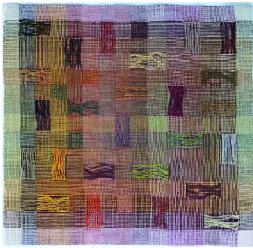
Sondra Bogdonoff - Weavings